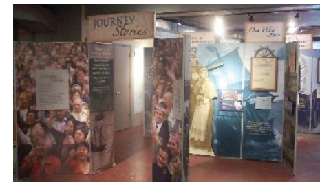
Last year's Smithsonian Journey Stories traveling exhibit installed at our museum.